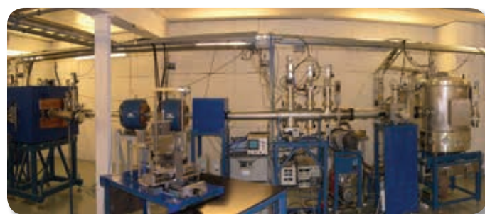
University of Jyväskylä

SEE testing of memory devices, including NAND, SDRAM and DDR, is efficiently performed using our FPGA based test solutions. The majority of SEE tests are conducted using cyclotrons at the University of Jyväskylä, Université Catholique de Louvain, Paul Scherrer Institute, LBNL and TAMU.